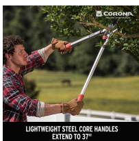
LIGHTWEIGHT STEEL CORE HANDLES EXTEND TO 37"